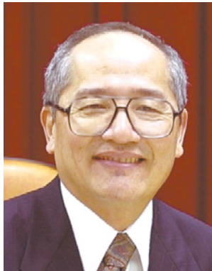
Professor Frank H. Shu Member of Board of Adjudicators Chairman of the Prize in Astronomy Committee

Professor Frank Shu is presently the President and Professor of Physics at the National Tsing Hua University in Taiwan and regarded as one of the world's leading authorities in theoretical astrophysics and star formation.