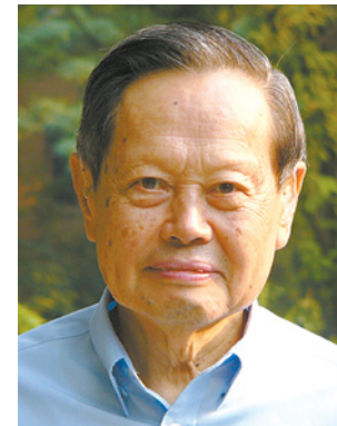
Professor Chen-Ning Yang

Professor Chen-Ning Yang, an eminent contemporary physicist, was Albert Einstein Professor of Physics at the State University of New York at Stony Brook until his retirement in 1999. He has been Distinguished Professor-at-large at the Chinese University of Hong Kong since 1986, and Ji-Bei Hoang and Kai-Qun Lu Professor at Tsinghua University, Beijing, since 2005.