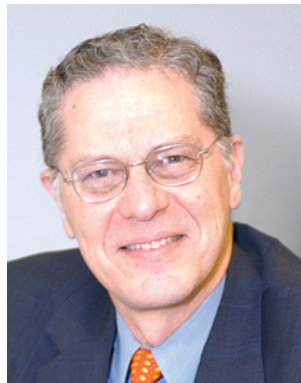
Member of Astronomy Committee Professor Joseph Hooton Taylor

Professor Joseph Taylor, an American, is the James McDonnell Distinguished University Professor of Physics at Princeton University and works in the field of radio astronomy. He co-discovered the first binary pulsar and was awarded the Nobel Prize for Physics in 1993.