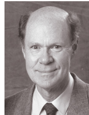
Member of Astronomy Committee Dr. Robert Woodrow Wilson